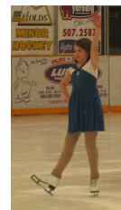
See more pictures on the website!